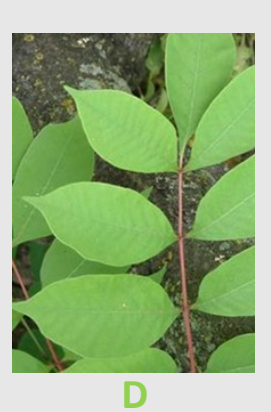
Submit your answers at https://www.surveymonkey.com/r/W2R3N3C for the chance to win a prize!